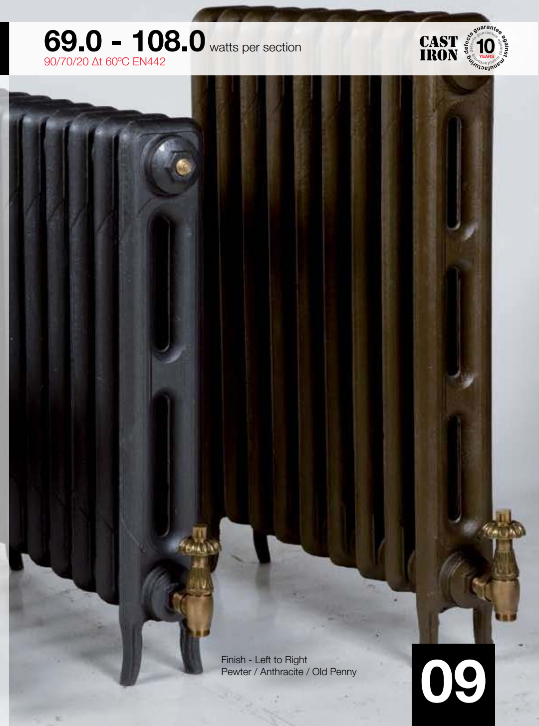
Finish - Left to Right Pewter / Anthracite / Old Penny

2 Grand Parade Polegate East Sussex BN26 5HG Telephone: +44 (0)1323 486848 info@radiatorcentre.com www.radiatorcentre.com